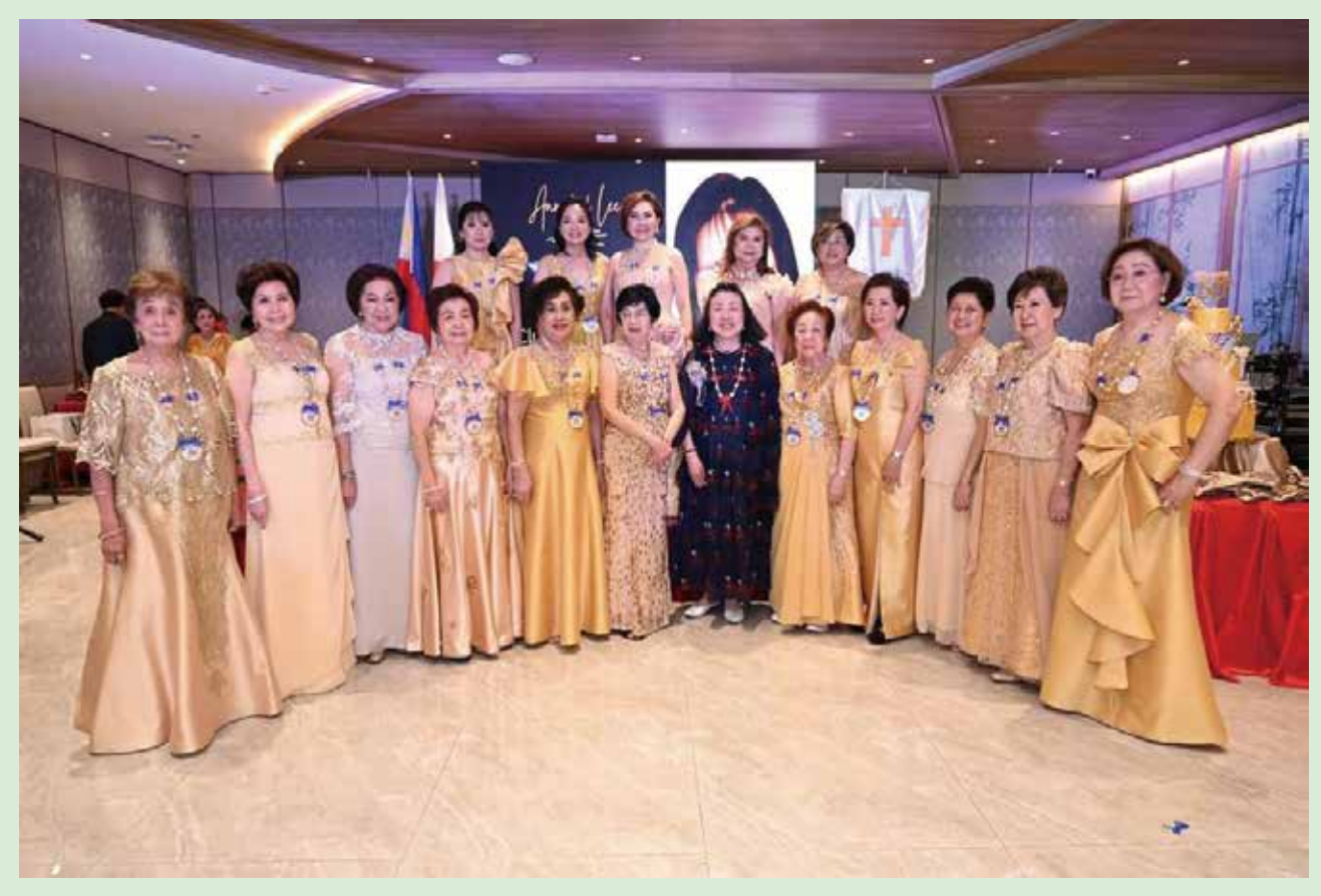
In a gold dress in honor of the Golden Anniversary