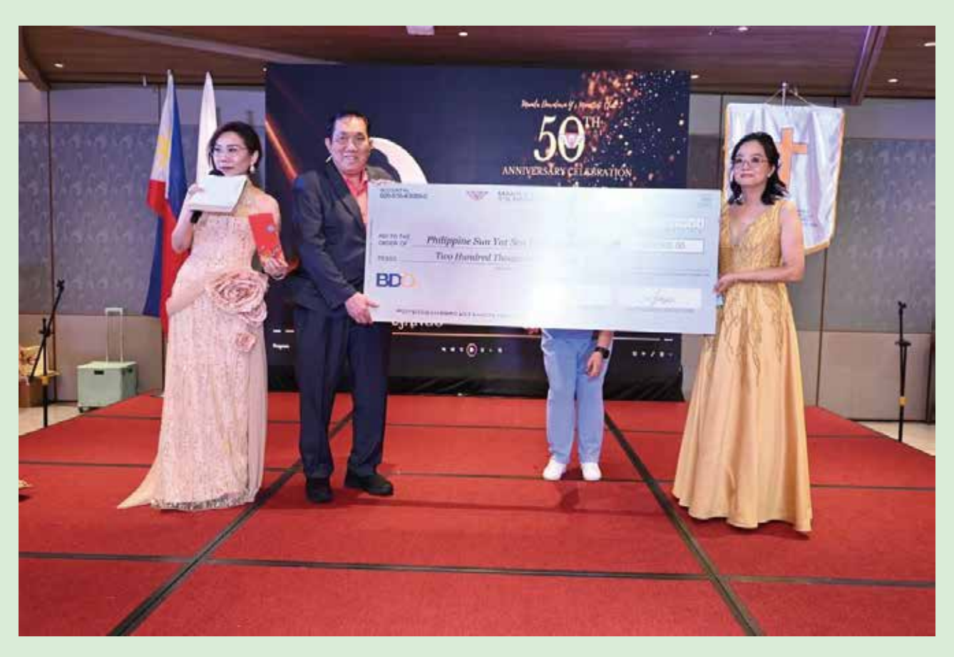
Contribution of the scholarship fund