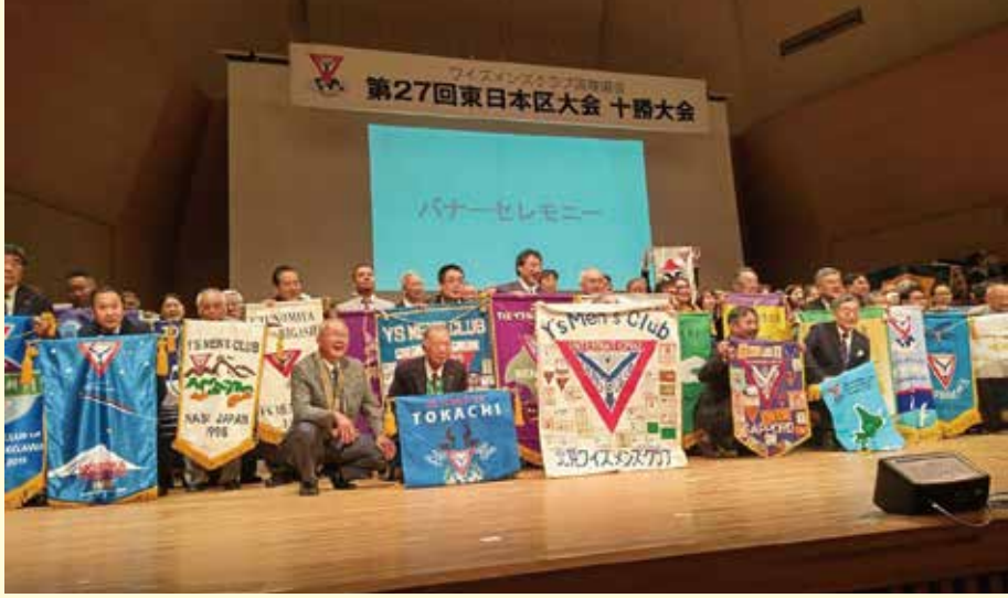
Japan East Region June 1st at Tokachi Hokkaido