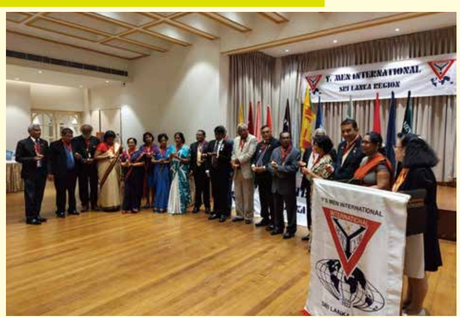
Sri Lanka Region June 14th

My husband and I were privileged to visit four Regional Conventions in June. Each convention was profoundly moving, as the characteristics of the Regions were evident. It was also an opportunity to truly experience my motto, "Shine and gain strength through fellowship. The opportunity for participants to enjoy each other's company and to think about the future of the Y's movement and their respective Regions was genuinely empowering, both for the Region and for the individual. It is my great pleasure to introduce each convention with a snapshot for you to capture what I mean about the differences.