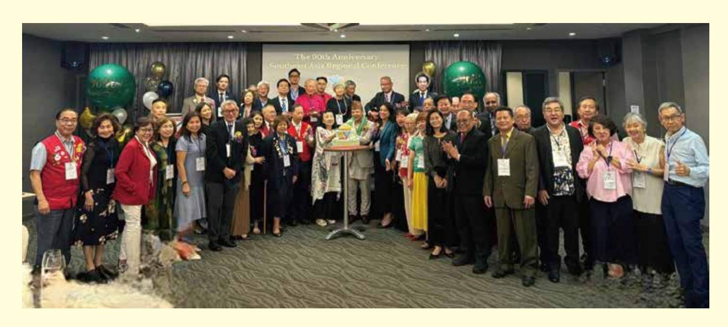
Southeast Asia Regional Conference June 21-22,2024 Singapore

Regional Conference stepped into 90th. Over 50 delegates and guests celebrated the anniversary together.