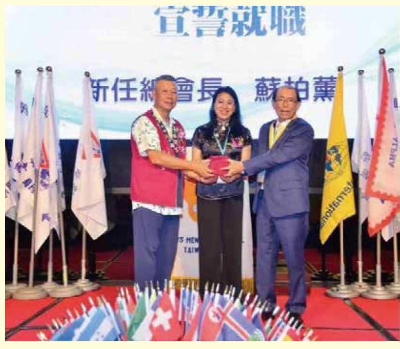
Taiwan Regional Conference June 1st Taiwan