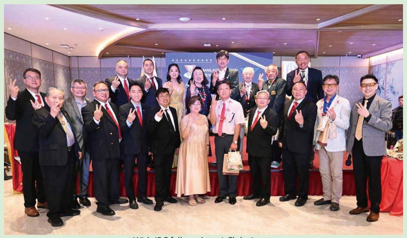
With IBC fellow, Atami-Club, Japan