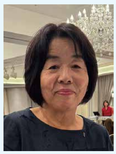
Greetings from the editor,

As we present the final issue of the Bulletin for this term, we also mark the beginning of a new chapter and the start of a fresh term.